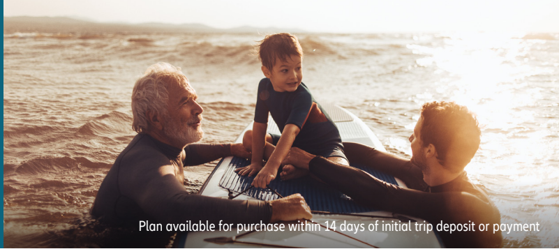
Plan available for purchase within 14 days of initial trip deposit or payment

Whether you're planning a solo adventure or a grand, multi-generational getaway, the whole point is to relax and enjoy your trip. Allianz Travel Insurance gives you the confidence to focus on the experience, knowing you are protected against many common travel mishaps and emergencies by a reputable company with a global network and award-winning customer service.